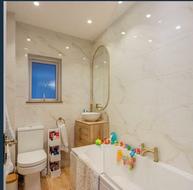
Taf Close, Barry, CF62 7QU